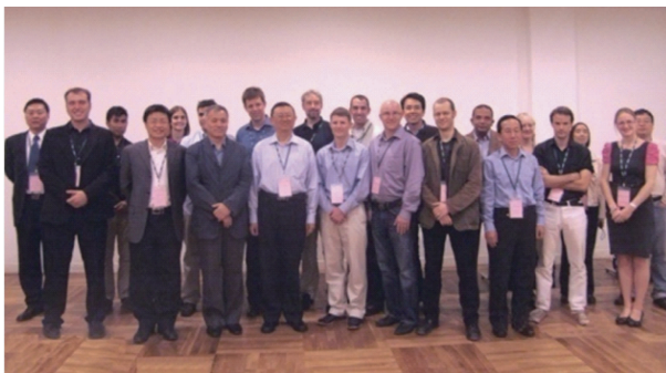
Gathering of grantees and their host researchers of RFIYS

111 foreign young scholars were funded by the Research Fund for International Young Scientist (RFIYS) to carry out joint research in China, with a total investment of 21 million RMB from NSFC. Among them, 31 were granted with extended funding. The grantees come from 42 countries including US, Japan, UK, Australia, France, Germany, Canada, Tunisia, Denmark, Romania, South Korea, Singapore, India, Turkey, Belgium, Ireland, Greece, Spain, Netherlands, Portugal and Colombia, etc. Their research areas span across all the scientific departments in NSFC. A gathering of around 50 grantees and their host researchers in Beijing was organized at NSFC to facilitate the communications between foreign young scientists and the Chinese scientific community.