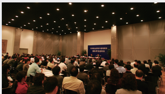
The kick-off meeting for the international evaluation of NSFC's funding and management performance held in Beijing.