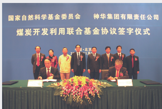
Signing ceremony of the NSFC-Shenhua Group Agreement.