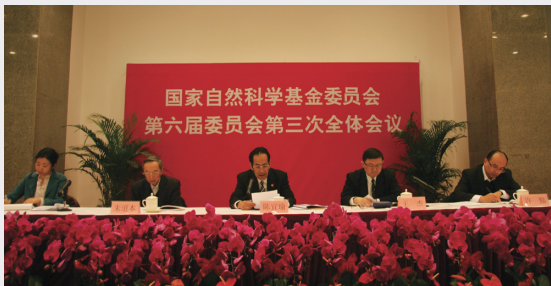
The 3rd Plenary Session of the 6th National Natural Science Foundation of China (NSFC) General Assembly held in Beijing.